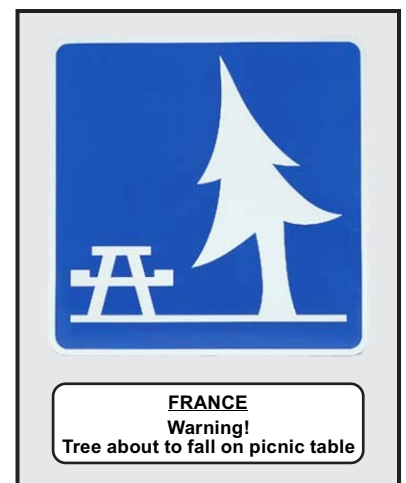
INTERNATIONAL SIGNS No. 15